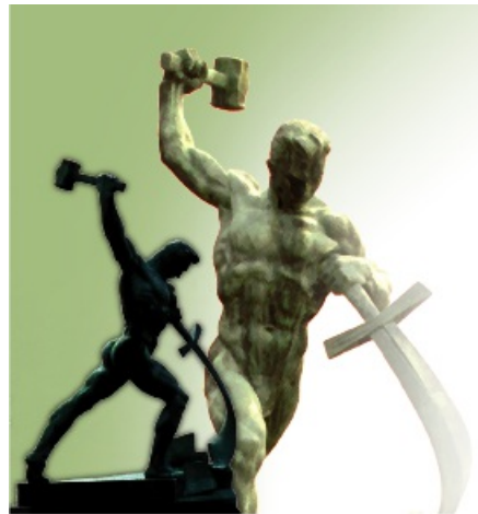
Swords into Plowshares Sculpture, United Nations, New York.

However, when “all men were in expectation” of the Messiah, Jesus the Messiah did come. But, at that time Israel’s expectation was that their Messiah would release them from the bondage of the Romans. They hoped that the Kingdom with its capital in Jerusalem would be established immediately. But the regathering and establishment of the Kingdom would only be centuries later—after the Great Diaspora—the great scattering during the Christian Gospel Age.