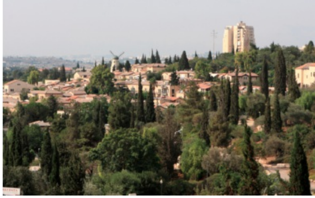
Landscape Modern Jerusalem

In the late 1800s “hunters” persecuted Jews in Russia and Russian-ruled lands. Pogroms (organized massacres) of that era awakened more Jews to the bait of the “fishers.” Those who responded became the early settlers who laid the foundation for the State of Israel. But the response of the majority of Jews in Diaspora was feeble at best. God foresaw this lack of enthusiasm to return to the Land of Israel. The time became ripe for more “hunters.”