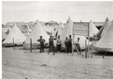
Immigration Camp in Palestine

Today in fulfillment of that prophecy Israel is being resurrected—bone by bone, sinew by sinew, flesh upon flesh. Finally, the Spirit will be breathed into Israel.