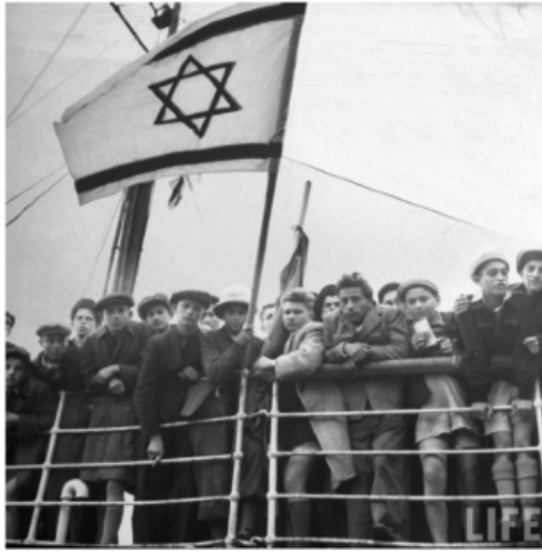
Haifa, Palestine. 1948 - Jewish immigrants, arriving in Haifa aboard a refugee ship, waving future flag of the state of Israel shortly before its official conception.

Io, I will save thee from afar, and thy seed from the land of their captivity; and Jacob shall return, and shall be in rest, and be quiet, and none shall make him afraid. For I am with thee, saith the LORD, to save thee: though I make a full end of all nations whither I have scattered thee, yet will I not make a full end of thee: but I will correct thee in measure, and will not leave thee altogether unpunished.” (Jeremiah 30:3-11)