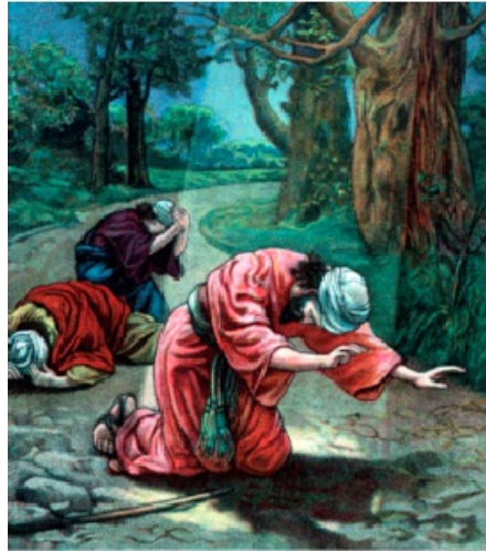
Saul's Conversion on the Road to Damascus

"I will make them jealous with those who are not a people; I will provoke them to anger with a foolish nation..." (Deuteronomy 32:19)