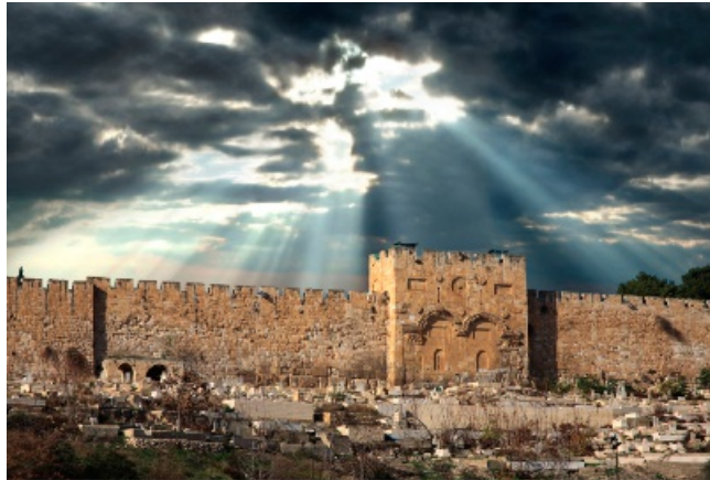
Jerusalem's Golden Gate

Is there any hope for the Jewish people in a world of latent as well as boldly open anti-Semitic hostility? How realistic are God’s promises not only for Israel—but the whole world of mankind? Can there be real hope for Israel to be a blessing? Zechariah, the Prophet, anticipates our concern, “And it will come about that just as you were a curse among the nations, O house of Judah and house of Israel, so I will save you that you may become a blessing. Do not fear; let your hands be strong.” (Zechariah 8:13 NAS)