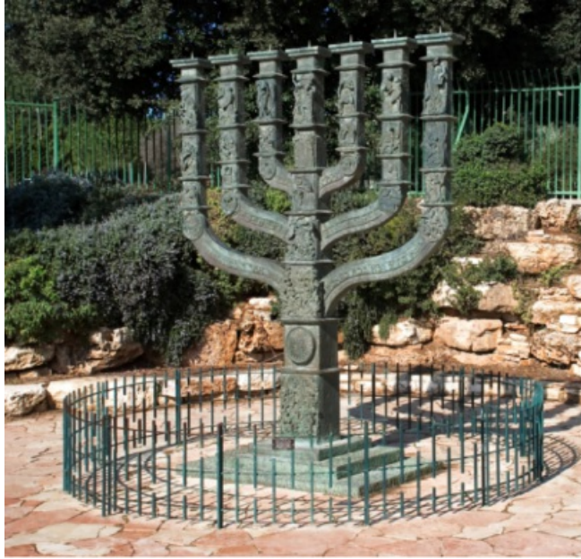
The Knesset's Menorah sculpture, Jerusalem, Israel

These promises for regathering Israel were not for the return from Babylon—but a return from “all the countries” at the End Times.