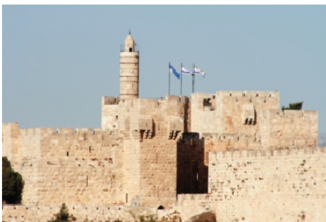
King David Tower, Jerusalem

“Thus saith the LORD of hosts; I was jealous for Zion with great jealousy, and I was jealous for her with great fury. Thus saith the LORD; I am returned unto Zion, and will dwell in the midst of Jerusalem: and Jerusalem shall be called a city of truth; and the mountain of the LORD of hosts the holy mountain. ” (Zechariah 8:2,3)