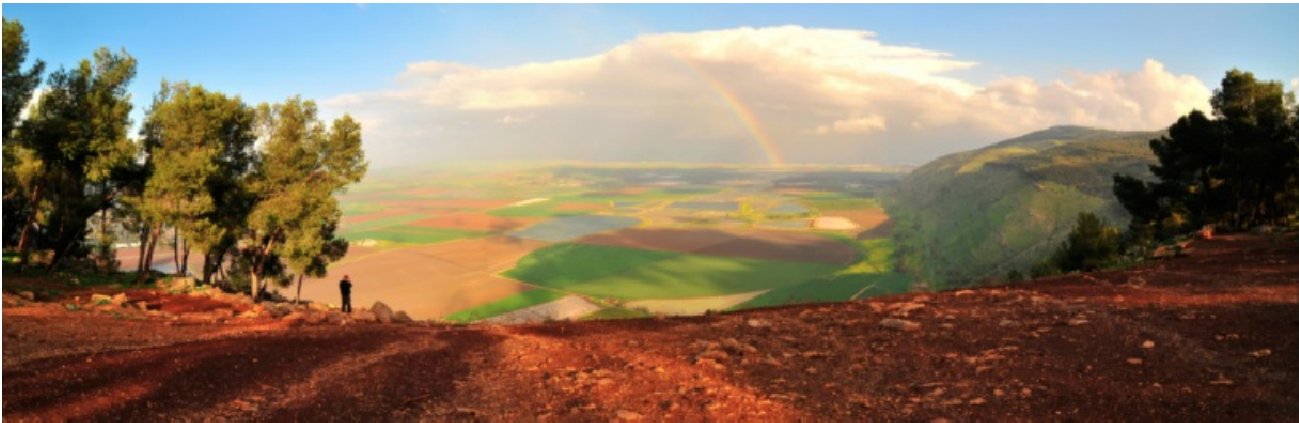
Panorama of the Jezreel Valley, Israel

"What then? What Israel sought so earnestly it did not obtain, but the elect did. The others were hardened [blinded]....I do not want you to be ignorant of this mystery, brothers, so that you may not be conceited: Israel has experienced a hardening in part until the full number of the Gentiles has come in . And so all Israel will be saved , as it is written....'The deliverer will come from Zion; he will turn godlessness away from Jacob. And this is my covenant with them when I take away their sins.' As far as the gospel is concerned, they are enemies on your account; but as far as election is concerned; they are loved on account of the patriarchs [Abraham, Isaac, Jacob], for God's gifts and his call are irrevocable. " (Romans 11:7, 25-29 NIV)