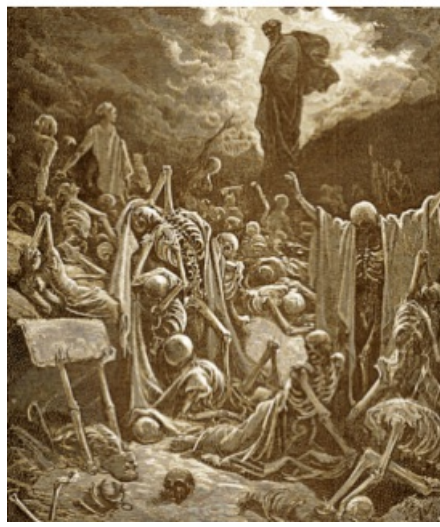
The Prophet Ezekiel's Vision of the Valley of Dry Bones

Dramatically, the Prophet Ezekiel (Chapter 37) was brought in vision to a “valley” to prophesy the regathering and rebirth of Israel. Ezekiel’s “Valley of Dry Bones” was a depiction of a nation that was virtually dead and scattered. After he prophesied—in amazement he saw the bones come together! Then “flesh” came upon the bones and eventually God’s Spirit (vs. 14) was breathed into them. That vision was an illustration of the promised gradual resurrection of the nation of Israel!