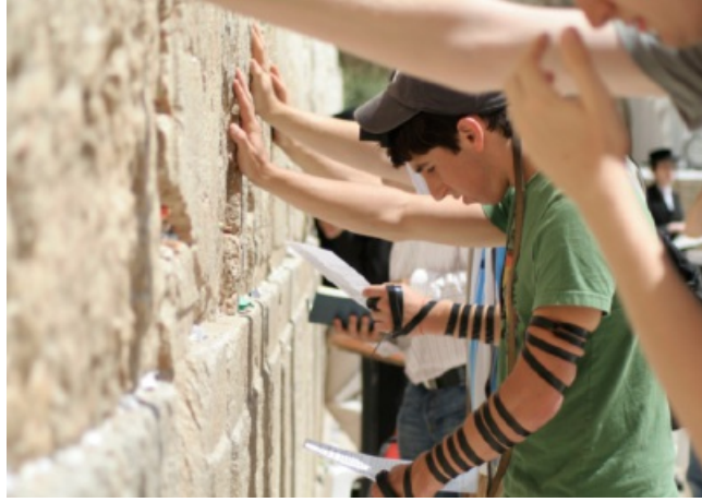
Visitors Praying at the Western Wall in Jerusalem

In any case, a huge spike has occurred in the number of anti-Semitic incidents throughout Europe and the world. Similarly, violence in France in 2005 by “youths” saw hundreds of autos torched nightly. (The politically correct term “youths” disguised the ethno-religious identity of Muslim youths.) Sporadic attacks against Jews have been launched against synagogues, Jewish centers, cemeteries and Holocaust memorials. Jewish children who merely wish to walk safely to school need special protection. And, as might be expected, the more observant Jews wearing identifiable head coverings are targeted more regularly.