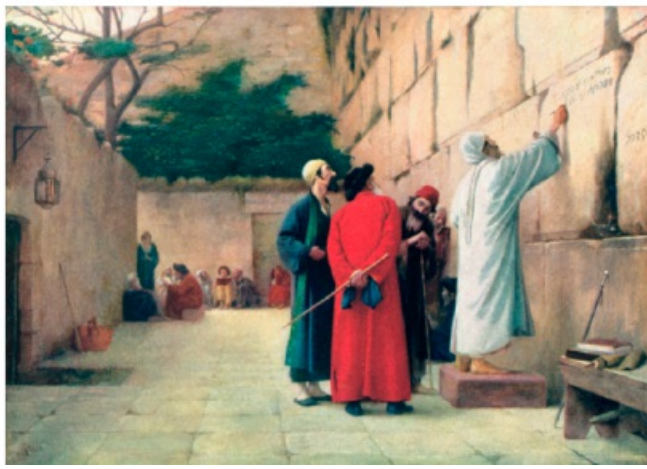
"At the Wailing Wall"

Upon such a base of false teachings, the Christian Church grew more and more intolerant of the Jews. The Apostle Paul's teaching that Israel would not be permanently cast off was ignored by the "official" Church. Even though, Paul taught, "all Israel shall be saved." Their blindness would only continue "until the fulness of the Gentiles come in" [i.e., the full number of Gentiles come into the Church] (Romans 11:25). In other words, Israel is still God's people! Therefore, the ominous prophecies of trouble to come upon Israel are only part of the story. God also promised that He will fight for His People and His Land as in the ancient "day of battle." (Zechariah 14:3) And God said He will "have mercy on the whole house of Israel, and will be jealous for my holy name...for I have poured out, my spirit upon the house of Israel." (Ezekiel 39:25-29)