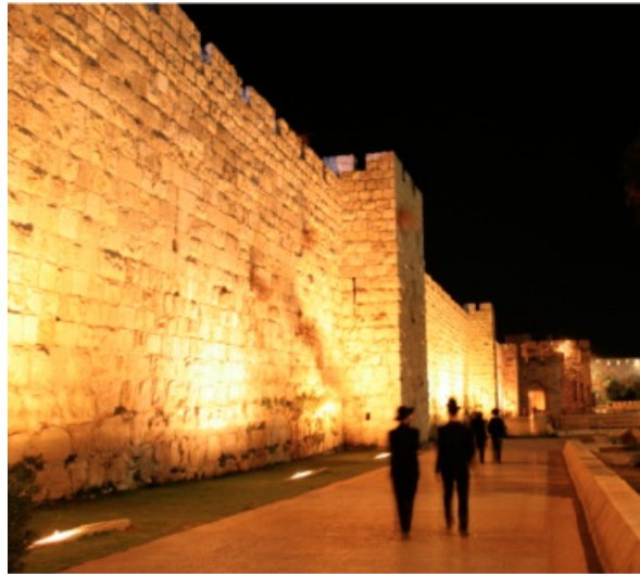
Orthodox Jews going to the Wailing Wall for night time prayers

Jesus, of course, was born in the Promised Land. His ministry was confined to the Children of Israel. Alas, only relatively few accepted Jesus. As a result of their rejection, Jesus proclaimed to Israel, “Your house is left unto you desolate.” But Jesus also said, “From now on you shall not see me until you say, ‘Blessed is he who comes in the name of the Lord.’” (Matthew 23:38, 39) Very soon, less than forty years later, Jerusalem and the Second Temple were laid waste and desolated by Rome. In A.D. 135 under the command of Hadrian, Rome again suppressed a rebellion led by a false Messiah by the name of Bar Kokhba. Rome destroyed 985 towns and villages, slew over 500,000 men, causing even more to die of starvation and sold many more into slavery. Thus began the Great Diaspora. Jewish people became exiles wandering from country to country the world over—only allowed to return to Jerusalem on the Ninth of Av to mourn the destruction of The Temple. In spite of that devastation, a very small remnant remained in the Land through the last two millennia right up to the present. Though trodden down by Christians and Muslims, they clung to their promises—living in the Land of Israel. [See Appendix C]