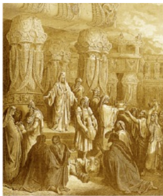
Cyrus restoring the Vessels of the Temple

During the periods of the Judges and the Kings, Israel was often invaded and temporarily occupied. During those captivities, many were plucked up and carried to other lands. Because of unfaithfulness, God permitted strangers to waste their cities, drink the wine of their vineyards and eat the fruit of their gardens. But not until the Chaldeans of Babylon destroyed and burned the Temple and Jerusalem and took most of Jewish people in captivity to Babylon was the Land totally desolated.