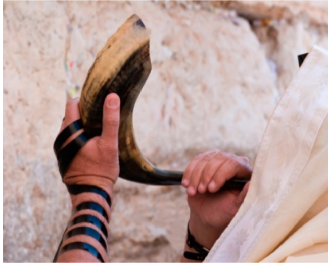
Shofar at Western Wall