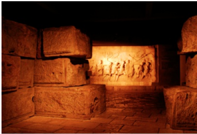
Diaspora Museum in Tel Aviv, Israel

Upon such a base of false teachings, the Christian Church grew more and more intolerant of the Jews. The Apostle Paul's teaching that Israel would not be permanently cast off was ignored by the "official" Church. Even though, Paul taught, "all Israel shall be saved." Their blindness would only continue "until the fulness of the Gentiles come in" [i.e., the full number of Gentiles come into the Church] (Romans 11:25). In other words, Israel is still God's people! Therefore, the ominous prophecies of trouble to come upon Israel are only part of the story. God also promised that He will fight for His People and His Land as in the ancient "day of battle." (Zechariah 14:3) And God said He will "have mercy on the whole house of Israel, and will be jealous for my holy name...for I have poured out, my spirit upon the house of Israel." (Ezekiel 39:25-29)