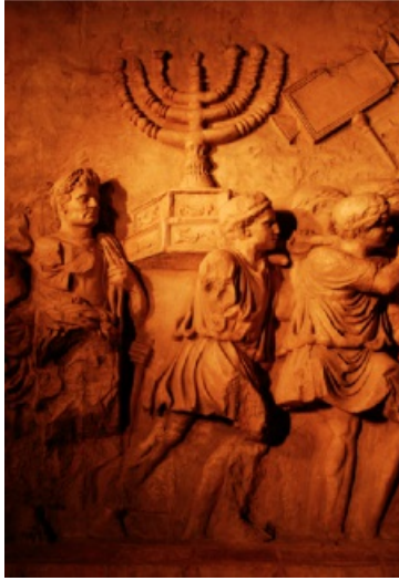
Diaspora Museum in Tel Aviv, Israel

Jesus, of course, was born in the Promised Land. His ministry was confined to the Children of Israel. Alas, only relatively few accepted Jesus. As a result of their rejection, Jesus proclaimed to Israel, “Your house is left unto you desolate.” But Jesus also said, “From now on you shall not see me until you say, ‘Blessed is he who comes in the name of the Lord.’” (Matthew 23:38, 39) Very soon, less than forty years later, Jerusalem and the Second Temple were laid waste and desolated by Rome. In A.D. 135 under the command of Hadrian, Rome again suppressed a rebellion led by a false Messiah by the name of Bar Kokhba. Rome destroyed 985 towns and villages, slew over 500,000 men, causing even more to die of starvation and sold many more into slavery. Thus began the Great Diaspora. Jewish people became exiles wandering from country to country the world over—only allowed to return to Jerusalem on the Ninth of Av to mourn the destruction of The Temple. In spite of that devastation, a very small remnant remained in the Land through the last two millennia right up to the present. Though trodden down by Christians and Muslims, they clung to their promises—living in the Land of Israel. [See Appendix C]