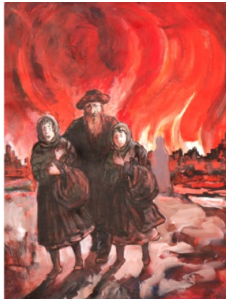
“Flight from a Pogrom”, Zalman Kleinman, 2001

“Thus says the LORD of hosts, I am exceedingly jealous for Jerusalem and Zion. But I am very angry with the nations who are at ease; for while I was only a little angry, they furthered the disaster.” (Zechariah 1:14,15 NAS)