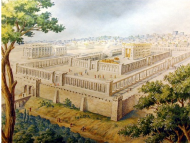
Temple of Solomon, circa B.C.1033

Thus after Israel’s End Time troubles are over, all the peoples of the earth (even Sodom and Gomorah) will be resurrected and will become “daughters” to Israel under the New Covenant. This New Covenant will have “a better” Mediator than Moses (Hebrews 8:6). That new Mediator will be the Messiah—the Christ. All the families of the earth will come to Israel to receive blessings (Zechariah 14:16-18) when the New Covenant is established and the Law of God is written “in their hearts.”