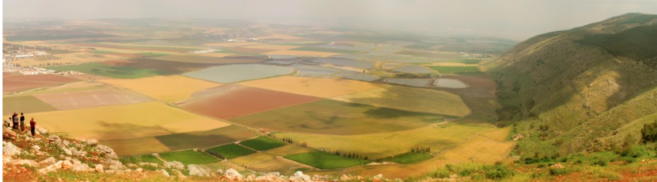
Panorama of the landscape of the Izrael Valley, Israel