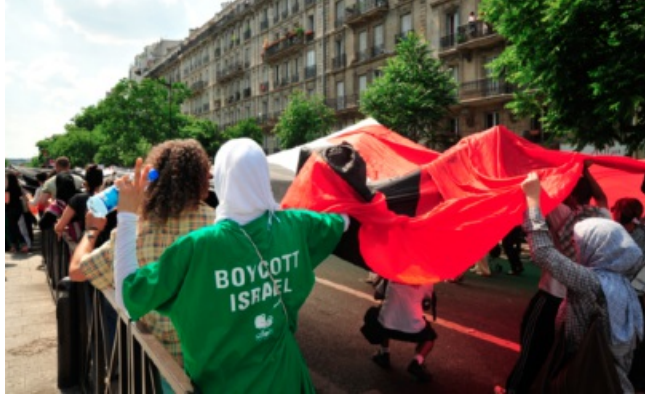
Pro-Palestinian demonstration in Paris, June, 2010