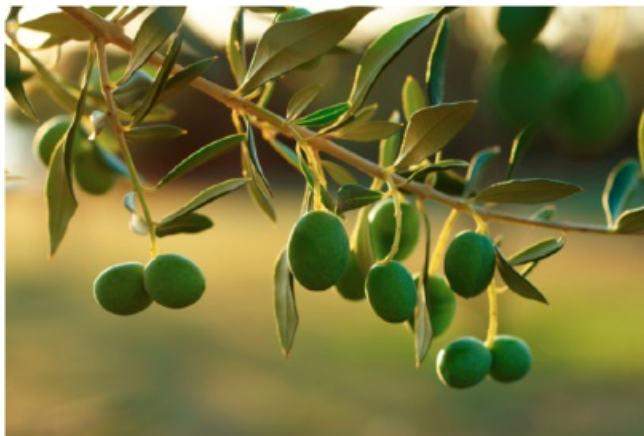
Olive Tree Branch

By contrast, Israel alone will continue to benefit from the lessons and corrections during her travail in order to be prepared for her role in the Messianic Kingdom. Israel will survive the End Times and enter into Christ’s Kingdom as the earthly seed of Abraham—the “sand of the sea shore”! (Genesis 22:17)