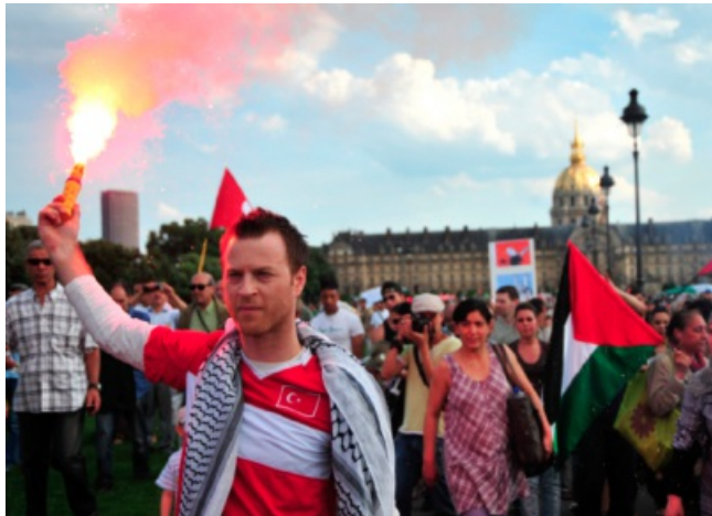
Pro-Palestinian demonstration in Paris, June, 2010

The Tunisian spark that lit the flames of revolt in early 2011 throughout the Middle East spread quickly to Israel's "moderate" neighbor Egypt. Israel's tenuous "peace treaties" with both Egypt and Jordan immediately appeared endangered. With increasing unrest across the Middle East, the Muslim Brotherhood along with Hamas called for Egypt's border with Gaza to be opened—and a Palestinian state with East Jerusalem as its capital. The only supposed solution to all the instability of the region—even to the European Union fearful of oil shortages—is to get Israel to give more concessions to their alleged "peace partners" of the P. A.